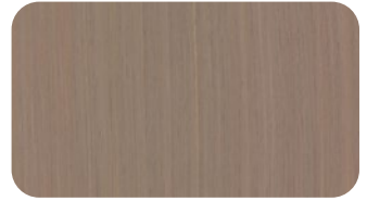
2-580 ALPI Quartered Walnut Item #2-580/X-8 4 x 8 | 10 mil