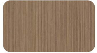
10.18F (50.73) ALPI Balanced American Walnut (QTR) Item #50.73 4 x 8 | Groove