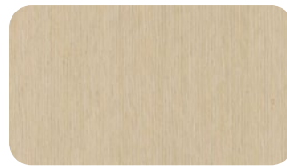
112 ALPI White Rift Oak Item #112/00/Y17-8 4 x 8 | 10 mil