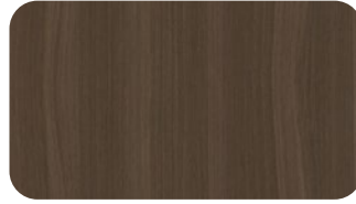
12.68 (2-249) ALPI Thermo Oak (Planked) Item #2-249/XP12-8 4 x 8 | 10 mil