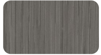
11.11F (50.31) ALPI Dark Grey Lati (QTR) Item #50.31 4 x 10 | Groove