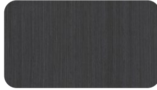
633 ALPI Black Ebony (QTR) Item #633/Y17-8 4 x 8 | 10 mil