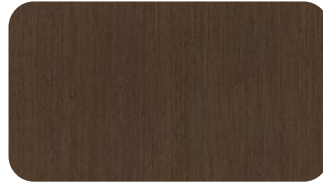
AW.03F ALPI Wenge (QTR) Item #AW.03 4 x 8 | Wax