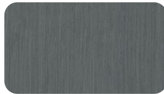
10.65F (50.65) ALPI Smoke Grey Oak (QTR) Item #50.65 4 x 10 | Groove