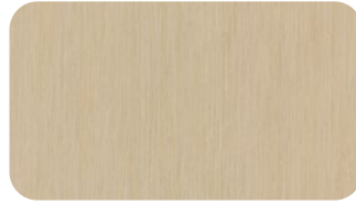
10.61F (50.60) ALPI Oak (QTR) Item #50.60 4 x 8 | Touch/Groove