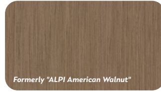
10.16 (589) ALPI Cardinal Striped (QTR) Item #589/00/Y12-8 4 x 8 | 10 mil