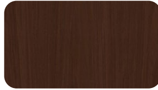
579 ALPI Black Walnut (F/C) Item #579/FNZ-3-8 4 x 8 | 10 mil