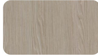
10.69 (2-298) ALPI Breeze Oak (Planked) Item #2-298/00/XP12-8 4 x 8 | 10 mil