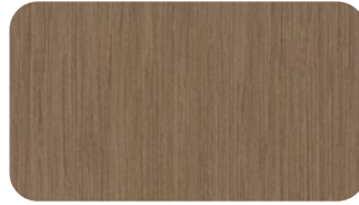
10.16F (AW.29) ALPI American Walnut (QTR) Item #AW.29 4 x 8 | Oil