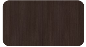
10.97F (50.67) ALPI Deep Oak (QTR) Item #50.67 4 x 10 | Groove