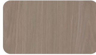
AW.11F ALPI Crown American Walnut Item #AW.11 4 x 8 | Wax