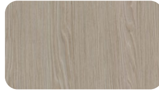
10.69F (50.602) ALPI Breeze Oak (Planked) Item #50.602 4 x 10 | Touch