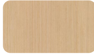
2-323F ALPI Ash (QTR) Item #2-323/XV-PF-8 4 x 8 | Oil