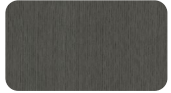
11.04 (2-199) ALPI Dark Grey Oak (QTR) Item #2-199/00/Y27-8 4 x 8 | 2 ply