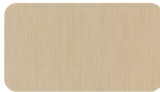
10.61 (2-233) ALPI Oak Item #2-233/00/Y17-8 4 x 8 | 10 mil